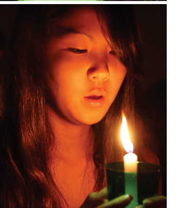
Each man should give what he has decided in his heart to give, not reluctantly or under compulsion, for God loves a cheerful giver. 2 Corinthians 9:7